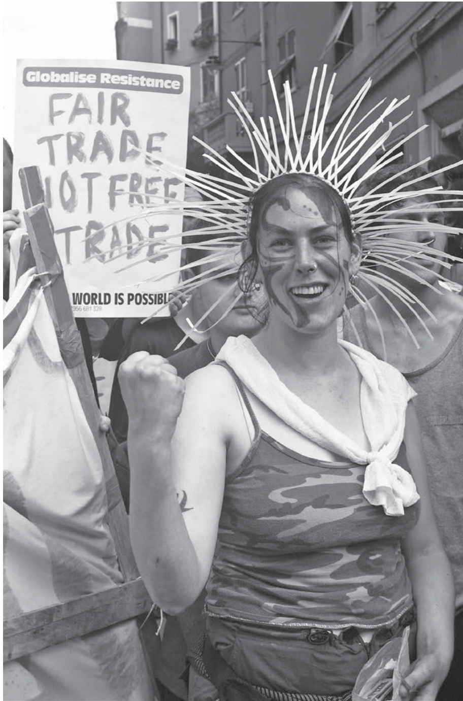
Protesters at a summit meeting of leaders of major industrialized countries in Genoa, Italy, 2001