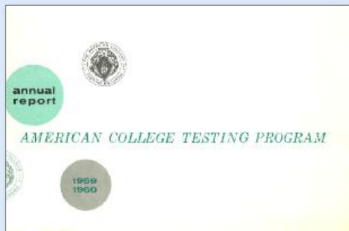
ACT Annual Report, 1959–1960

The 2015 ACT Annual Report describes our progress during the past fiscal year, as it should, but it also honors the vision of the people who preceded us, and whose wisdom continues to inform the work we are privileged to perform today.